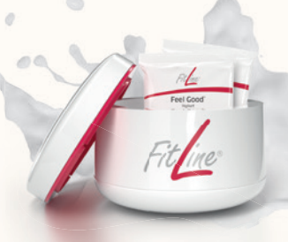
FitLine Feel Good Yoghurt Maker